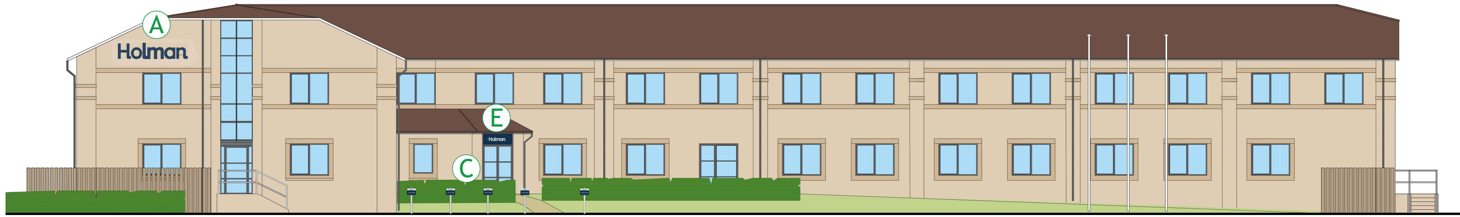
PROPOSED ELEVATION C 1:100 @A1