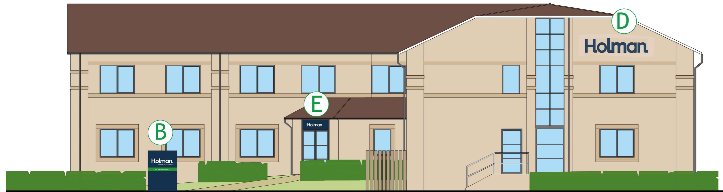
PROPOSED ELEVATION D 1:100 @A1